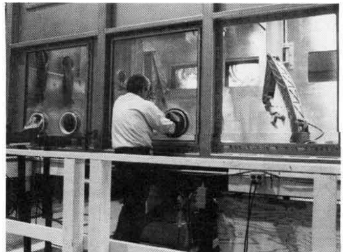
Fig. 3. WCC operating side.