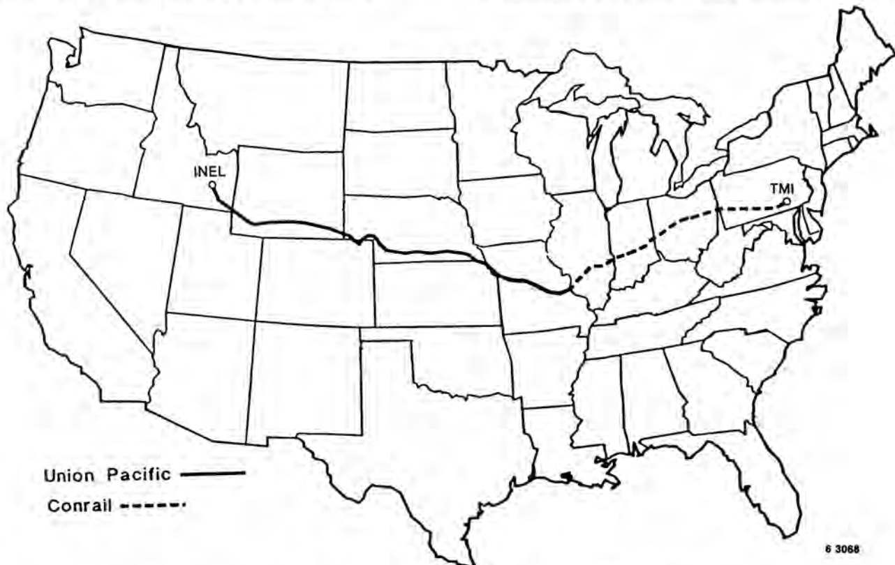
Fig. 2. Rail route for transporting the TMI-2 core debris from Middletown, PA to the Scoville Siding of INEL, west of Idaho Falls, ID.

Monitoring/Communications - After the train with casks exits TMI, the engineer is required to telephone his control center once every four hours until arrival at INEL. The control center for Conrail is located in Philadelphia, while that for Union Pacific is located in Omaha. Each time the engineer telephones, he informs the dispatcher of his exact location and information about any unusual occurrence. In turn, the control center relays the same information on the same schedule by telephone to the Warning Communication Center of DOE and the Traffic Manager of EG&G Idaho, both at INEL. While the train is in motion, the control center monitors by computer the speed and location of the train, as well as the presence of nearby trains using the same track system. Scanners located at predetermined distances along the tracks automatically sense the multicolor bar codes on each railcar of the train and relay information on location, speed, time, date, and so forth to the control center. The control center thus knows the location of the train at any particular point in time. Besides talking with the control center, the engineer for the first three shipments regularly communicated by radiotelephone with surveillance personnel in the